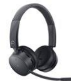
Dell Pro Wireless Headset - WL5022

Elevate your video conferencing experience with this high quality 4K webcam that optimizes your visuals with a large 4K Sony STARVIS™ CMOS sensor and AI Auto-Framing.