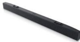
Dell Slim Soundbar - SB521A

An immersive 34" WQHD curved monitor with wide color coverage and extensive connectivity including RJ45, USB-C® and quick-access front ports.