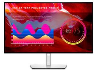
Dell UltraSharp 27 Monitor - U2722D

World's slimmest and lightest soundbar offers exceptional audio clarity and easy magnetic attachment to your Dell monitors, ensuring a clutter-free desk.