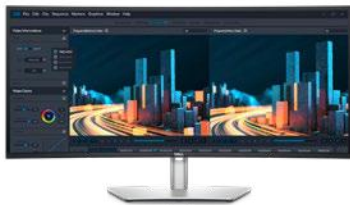
Dell UltraSharp 34 Curved USB-C HUB Monitor - U3421WE

An immersive 34" WQHD curved monitor with wide color coverage and extensive connectivity including RJ45, USB-C® and quick-access front ports.