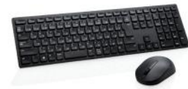
Dell Pro Wireless Keyboard and Mouse - KM5221W

Experience lightning fast charging and Thunderbolt 4 connectivity with this flexible and powerful modular dock.