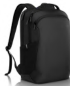
Dell EcoLoop Pro Backpack - CP5723

Write naturally and precisely with this multi-protocol, high sensitivity active pen for our 2-in-1s.