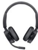
Dell Pro Wireless Headset - WL5022

Compact and portable 7-in-1 USB-C mobile adapter provides superb video, data connectivity and up to 90W power pass-through to your PC.