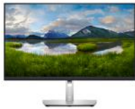
Dell 27 USB-C HUB Monitor - P2723DE

Stay productive no matter where you work with this sleek 27" GHD hub monitor with ComfortView Plus.